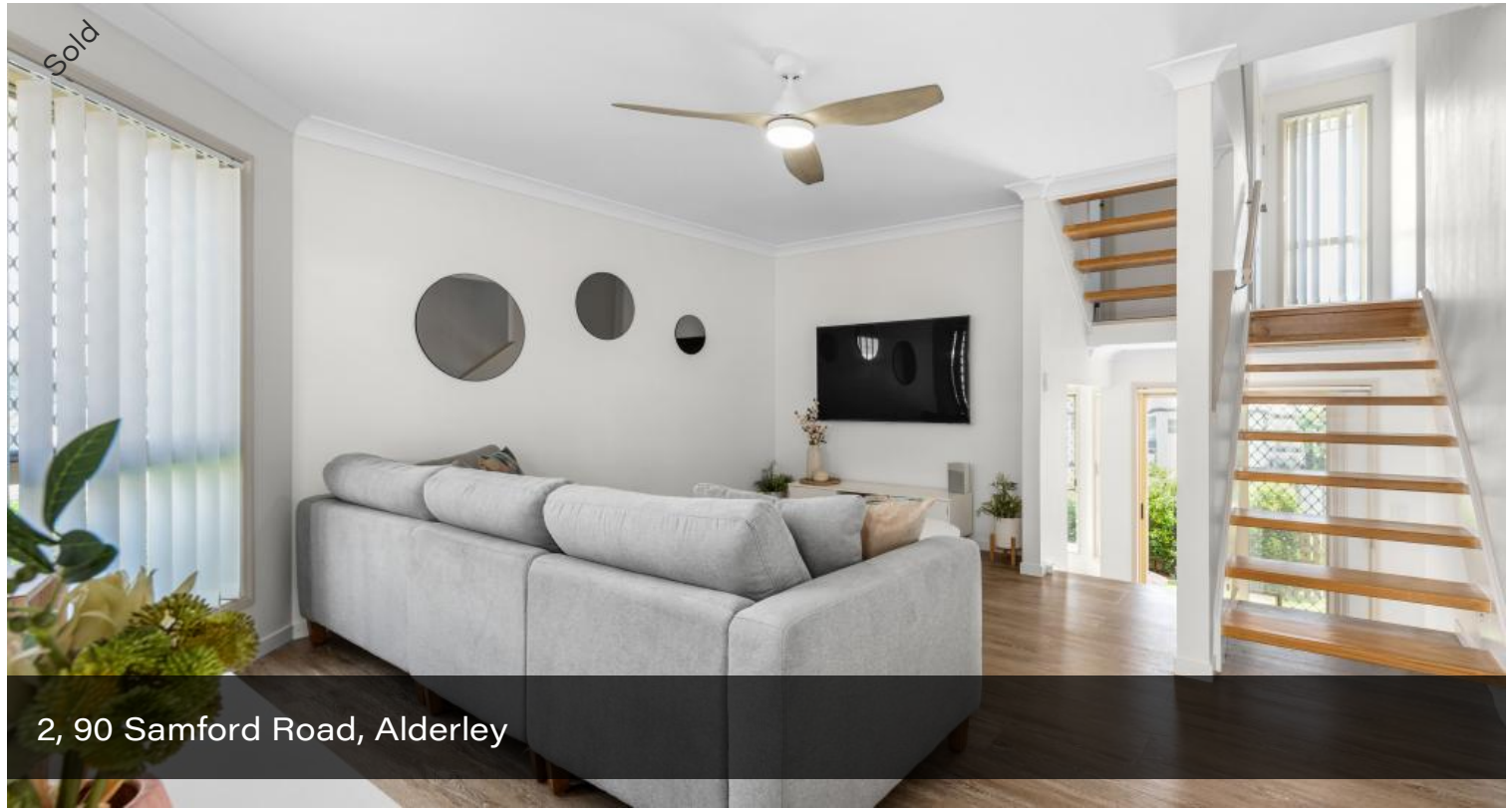
2, 90 Samford Road, Alderley